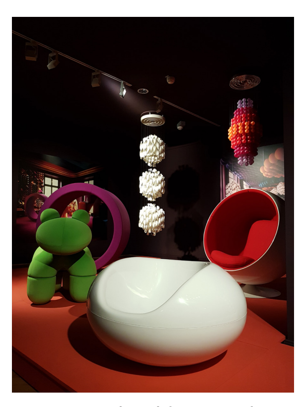
Figure 4. From the exhibition "Nordic Design: The Response to the Bauhaus", Bröhan-Museum, Berlin, 24 October 2019 - 1 March 2020, Photo: Joona Rantasalo.

Exhibition book: Tobias Hoffmann, ed., Nordic Design. Die Antwort aufs Bauhaus – Nordic Design. The Response to the Bauhaus (Berlin: Bröhan-Museum / Stuttgart: arnoldsche Art Publishers, 2019).