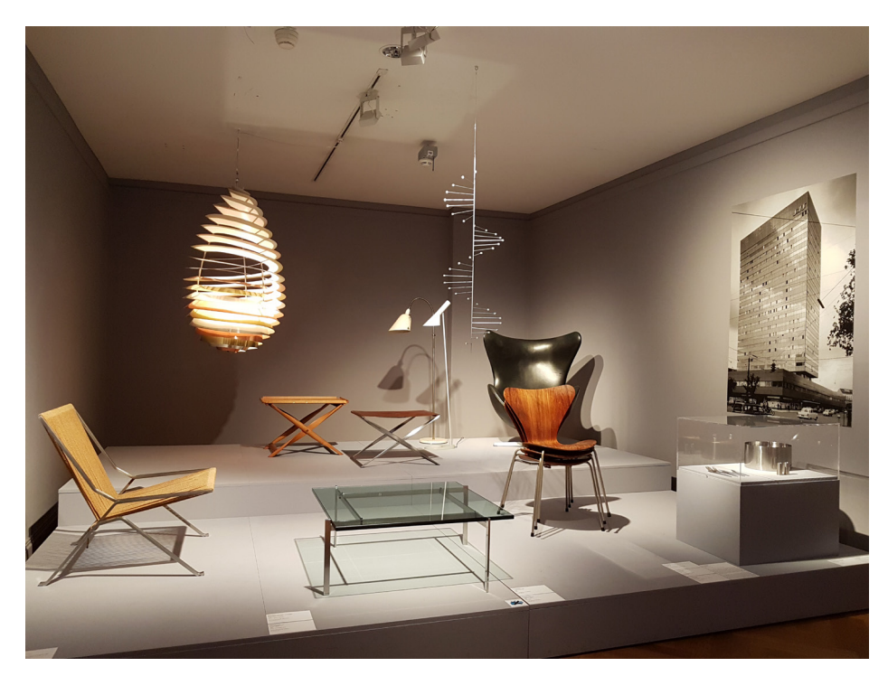
Figure 2. From the exhibition "Nordic Design: The Response to the Bauhaus", Bröhan-Museum, Berlin, 24 October 2019 - 1 March 2020.