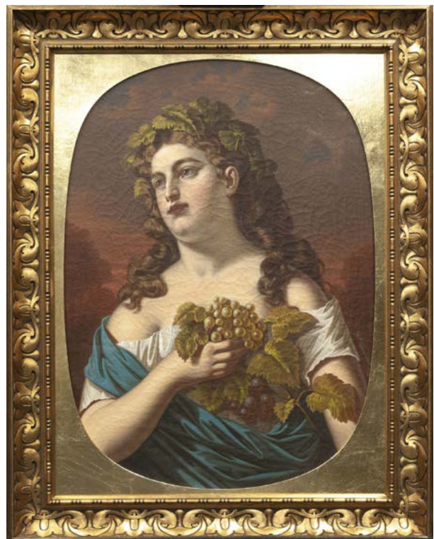
Figure 5. (5.1) Before and (5.2) after conservation. (5.3) With frame.

the violent, drunken, and frenzied followers of Bacchus. The figure in the painting seems rather sedate in contrast to this description. The figure seems unapproachable, lost in its thoughts gazing into the remoteness – rather god-like. This sedateness, in my view, would point more towards interpreting the figure as Bacchus. In the absence of any clear attributes of Bacchus, such as wine and feline fur, it could just as well be viewed as a female bacchante. With the removal of the restorations the motif was revealed as having an interesting interpretation as a possible male figure, as construing the figure to be physiologically female was now perhaps less apparent. The figure remains androgynous and possibly this slight ambivalence of gender was the reason for the modification by excessive overpainting. Unfortunately, there is no record of the painting prior to its purchase by the current owner but based on material evidence, such as the use of a thin layer of light grey priming or ground, it