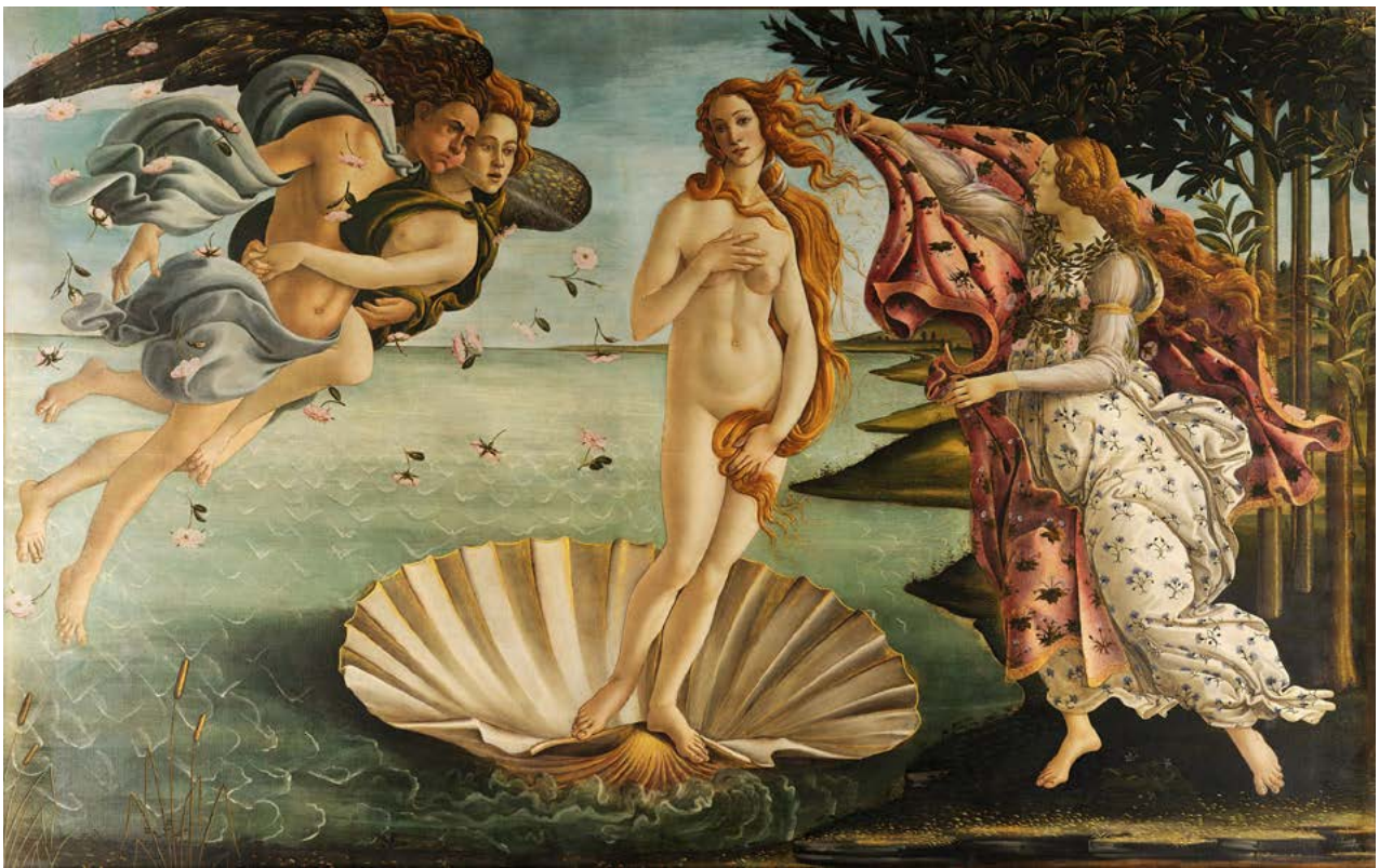
Figure 6. (6.1) Sandro Botticelli, The Birth of Venus , c. 1484–1486. Tempera on canvas. 172.5 cm × 278.9 cm. (6.2) Tratteggio restoration visible in the upper left corner on The Birth of Venus .