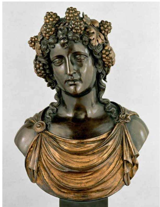
Figure 4. Pier Jacopo Alari de Bonacolsi, Bacchus (1520/22). Partially gilded bronze, 59 x 43 x 27 cm.