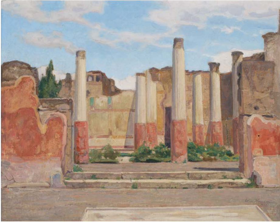
Image 5. Werner von Hausen, Pompeii , 1926. Oil painting on cardboard, 51 x 64 cm. Private collection.

The Finnish artist was attentive to the classical aesthetic developed as a result and drew from it a stylistic interpretation of his own. He infused a sense of eternity into his depictions of ancient ruins (image 5), rocky landscapes, but also into the stillness of his Nordic landscapes (image 6). It is quite remarkable that his oeuvre does not include many animated scenes, but mostly landscapes devoid of any human presence, as well as numerous still-lives, and somewhat impassive portraits. With their soothing tones of blues and greens, their balanced and symmetrical composition, his works exude classicism.