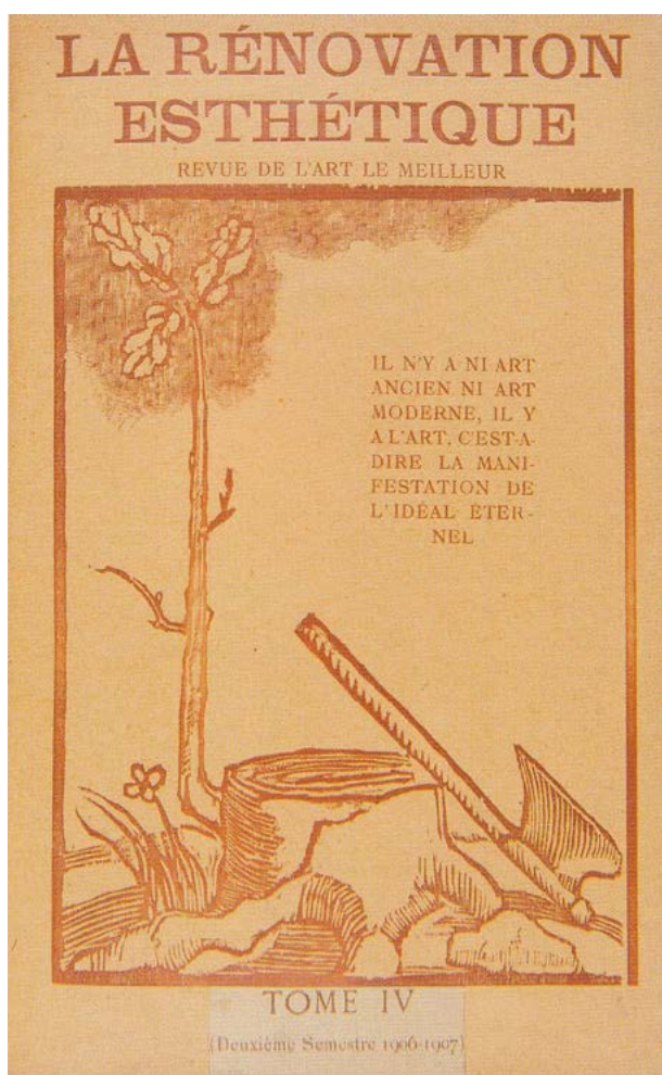
Image 4. Cover of the journal La Rénovation Esthétique, Vol. IV, 1906–1907, Private collection.